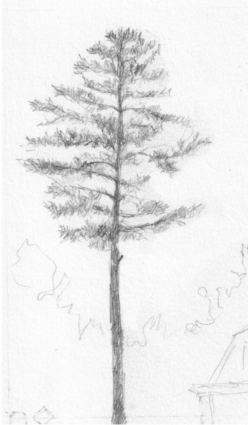
Lots of short pencil lines used to show the pine's needles.